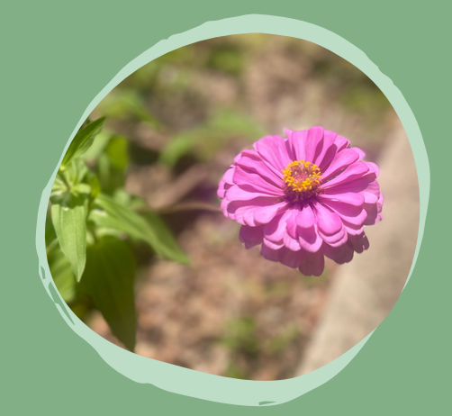
BUTTERFLY & VEGETABLE GARDENS