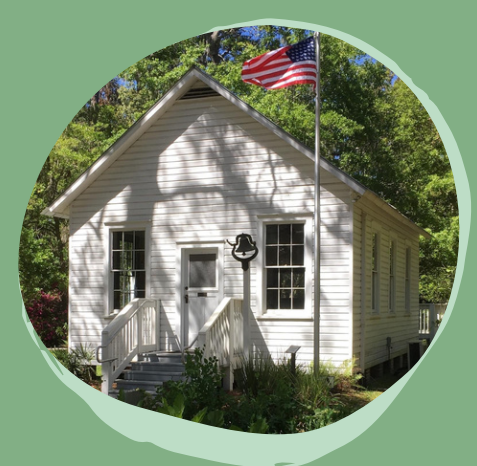
WALTER JONES HISTORICAL PARK